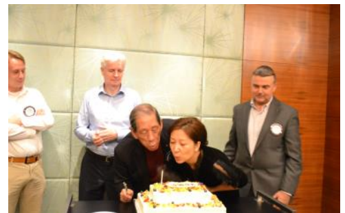
Happy Birthday Celebration