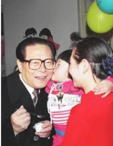
President Jiang received a kiss after his hands-on oral vaccination to a girl.

On December 5, 1993, the People's Republic of China launched the world's largest National Immunization Day (NID) by then. In a 24-hour period, the world's most populous country immunized more children than in all of Asia and Africa. An estimated 100 million children received two doses each of oral polio vaccine at local immunization posts and health centers. Chinese President Jiang Zemin and several state leaders