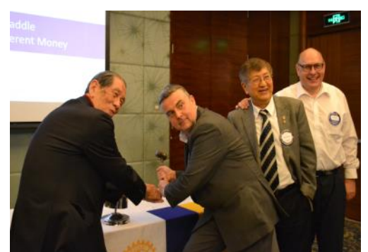
Ride the Saddle